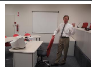
Hearing room -WC RHT 2007