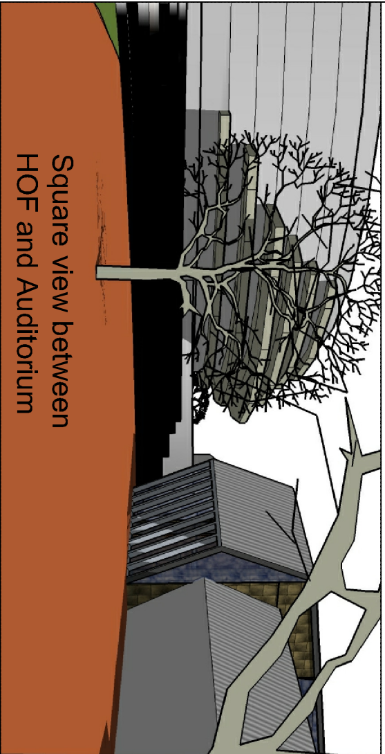
Square view between HOF and Auditorium