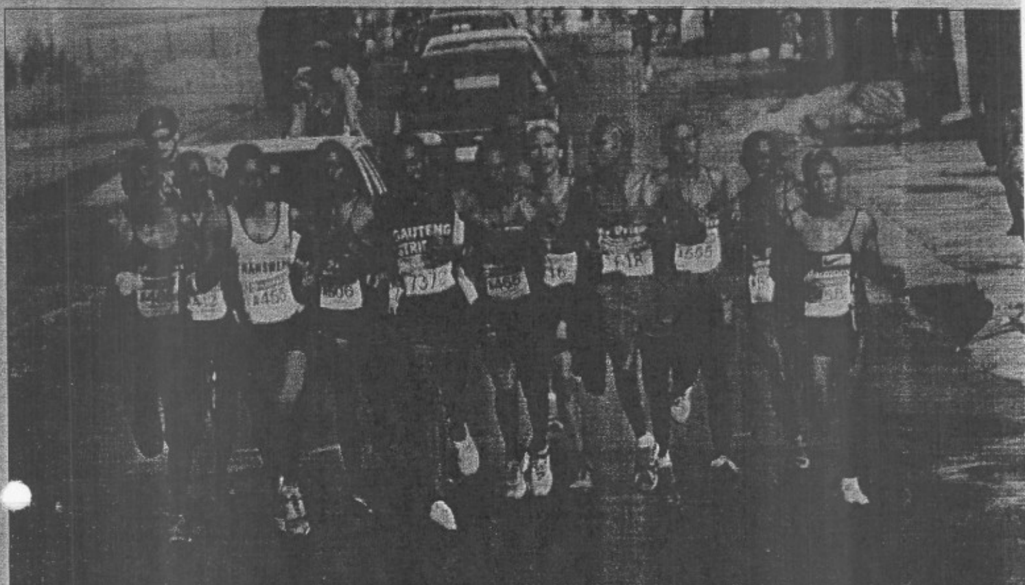
CLOSE CALL: Central Gauteng Athletics has agreed to host the Soweto Marathon in November after talks with former race sponsor Nedbank ended in deadlock.