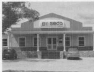
← Seda Chris Hani