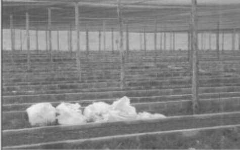
Bophelo ke Matla (Sasolburg)