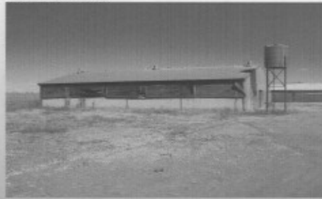
Waya Waya (Brandfort)