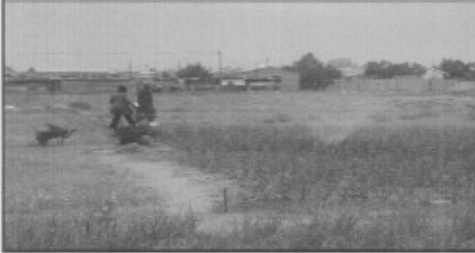
Lema u Vune (Sasolburg)