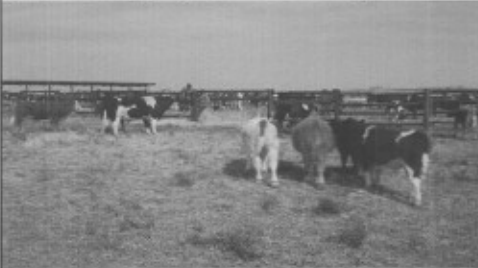
Woodbridge (Thaba Nchu)