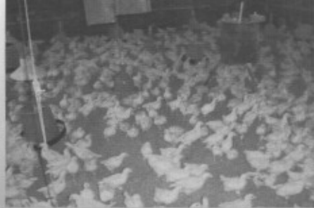
Itekeng Poultry (Deneysville)