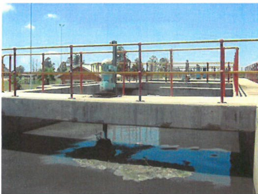
Figure 7 – Broken motors

Figure 5 & 6 shows several aerators not working.