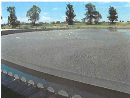
Figure 8 – Secondary Clarifier

Figure 7 & 8 shows more broken motors and non functional clarifier.