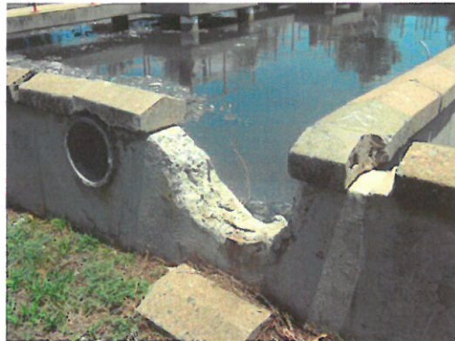
Figure 4 – Broken Infrastructure

Figure 3 shows a missing sludge pump. Figure 4 shows broken infrastructure