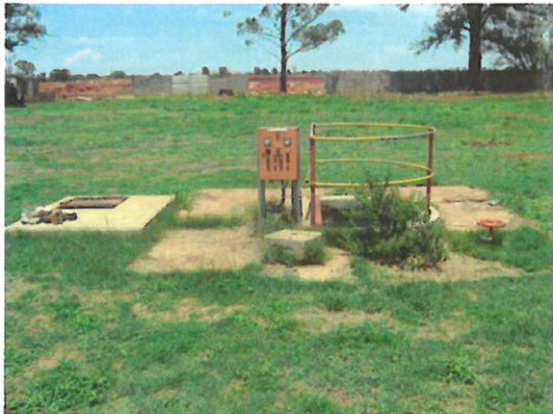
Figure 3 – Missing pumps