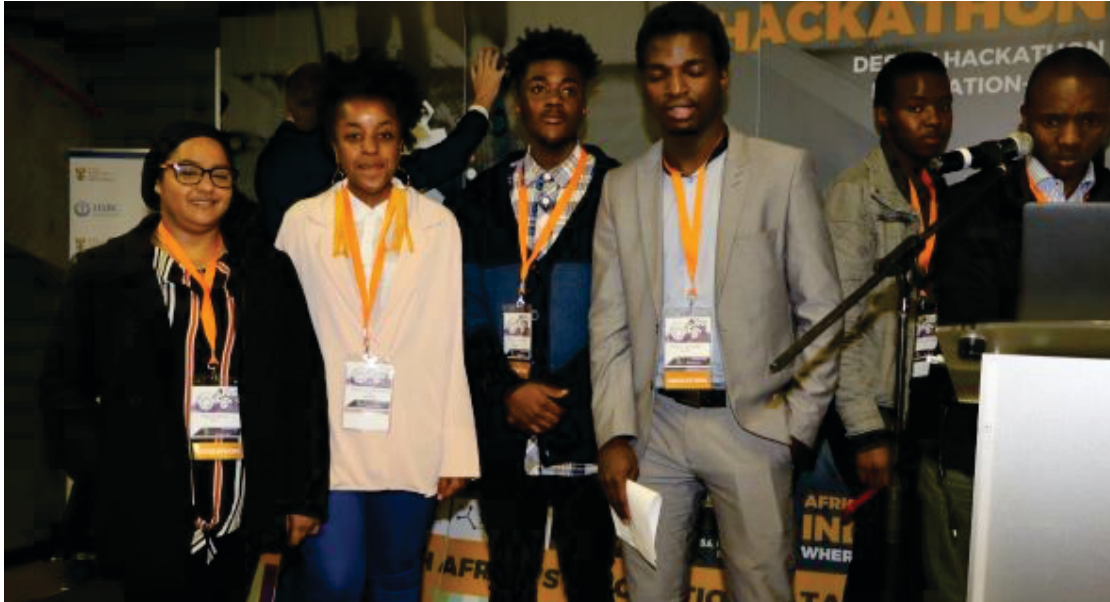
Figure 2: Participants at the Data Innovation Hackathon