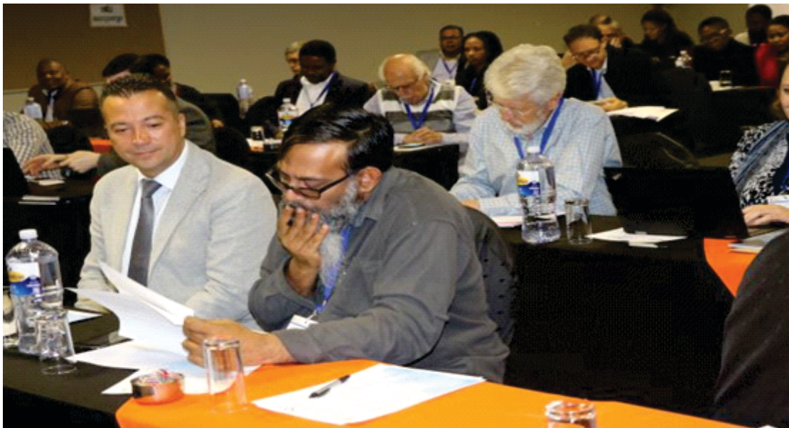
Figure 3: Participants of the National STI Foresight Exercise Stakeholder Participation

Together with the appointed service providers, NACI hosted a successful two-day workshop on the National STI Foresight Exercise. The workshop was held on 24 to 25 July 2018 at the Saint George's Hotel, Pretoria. The aim of the workshop was to provide the participants with a platform for considering the identified and prioritised STI domains; for creatively identifying new STI domains; and for prioritising the domains.