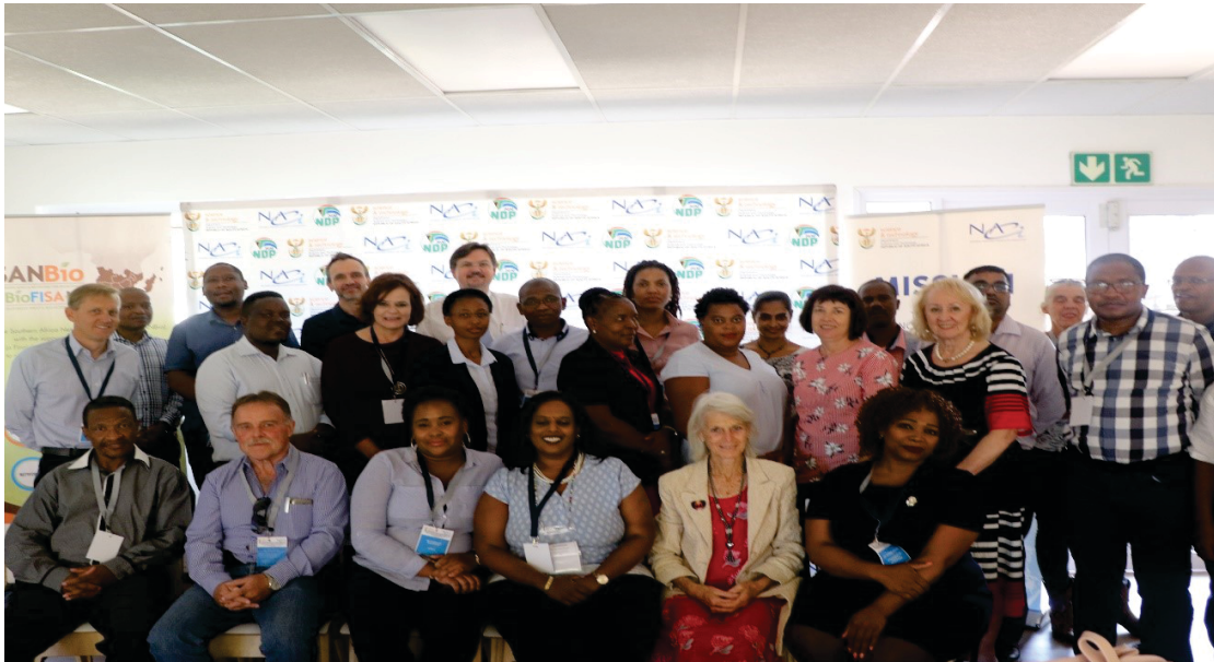
Figure 4: Participants of the Roundtable discussion on the South African Innovation System in the age of technology emergence and convergence

NACI held a roundtable discussion on “The South African Innovation System in the age of technology emergence and convergence”. The aim of the discussion was to share research findings from the workstream and to obtain inputs for and insights into policy advice from role players within the South African national system of innovation (NSI). The event took place on 29 March 2019 and the participants included stakeholders from government, the private sector, universities, science councils and non-governmental organisations (NGOs).