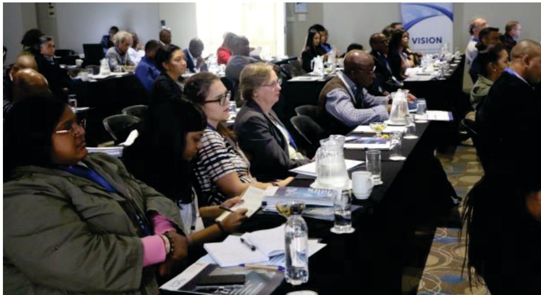
Figure 1: Delegates at the 2018 KwaZulu-Natal STI Indicators Report Roadshow

In an effort to ensure wider dissemination of the findings of the 2017 South African STI Indicators Report beyond Gauteng, NACI teamed up with partner organisations to host roadshows on the report in Durban and Cape Town. The KwaZulu Natal roadshow, which was hosted in Durban on 17 July 2018 in partnership with the Human Sciences Research Council (HSRC), focused on the local innovation system of the province, with panel discussion on the topic. The roadshow in the Western Cape was hosted in Cape Town on 20 July 2018 in partnership with the Centre for Science, Technology and Innovation Indicators (CeSTII) of the HSRC. The theme of the roadshow was “Disruptive Digitalisation, Transformative Change and Inclusion: How do we design a responsive measurement agenda in South Africa?”