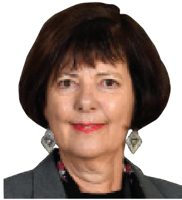
Ms Barbary Creecy, MP Minister of Forestry, Fisheries and the Environment