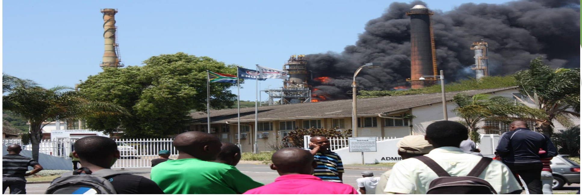
Fire at Engen Refinery: October 2011