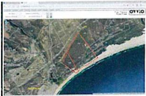
LOCALITY MAP OF PAPIES FONTEIN.jpg 536K

Gmail - Request for transfer into Links Royal House Kouga title (Kho san Community)