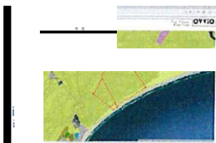
ZONING MAP OF PAPIES FONTEIN.jpg 420K