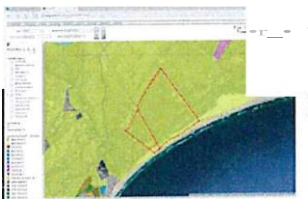
ZONING MAP OF PAPIES FONTEIN.jpg 420K