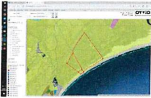
ZONING MAP OF PAPIES FONTEIN.jpg 420K