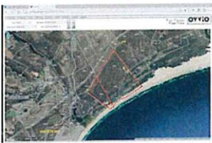
LOCALITY MAP OF PAPIES FONTEIN.jpg 536K