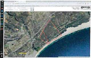
LOCALITY MAP OF PAPIES FONTEIN.jpg 536K