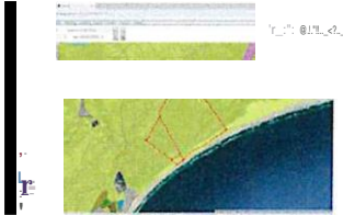
ZONING MAP OF PAPIÉS FONTEIN.jpg 420K