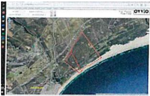
LOCALITY MAP OF PAPIES FONTEIN.jpg 536K

Gmail - Land parcel details - Links Royal House Great Place