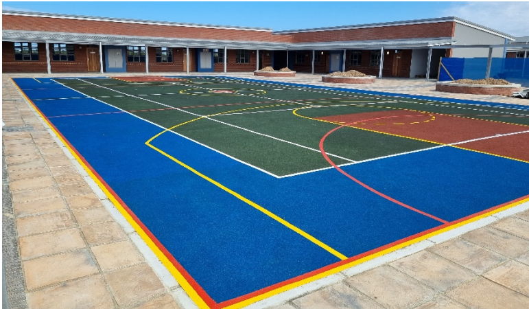
Rivergate Primary School