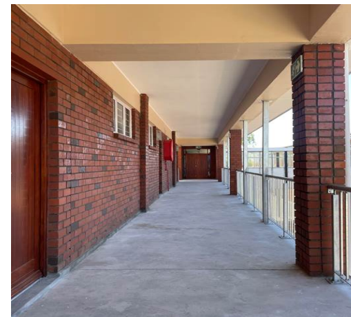
Parow High School