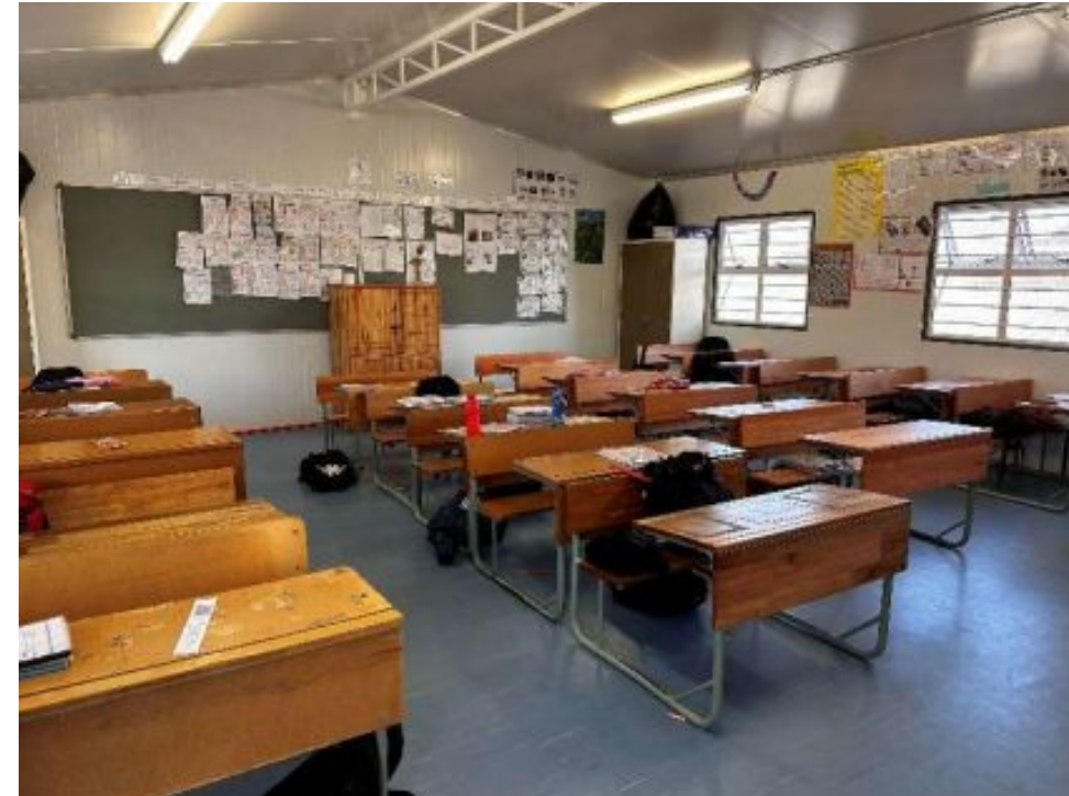
Perseverance Primary School