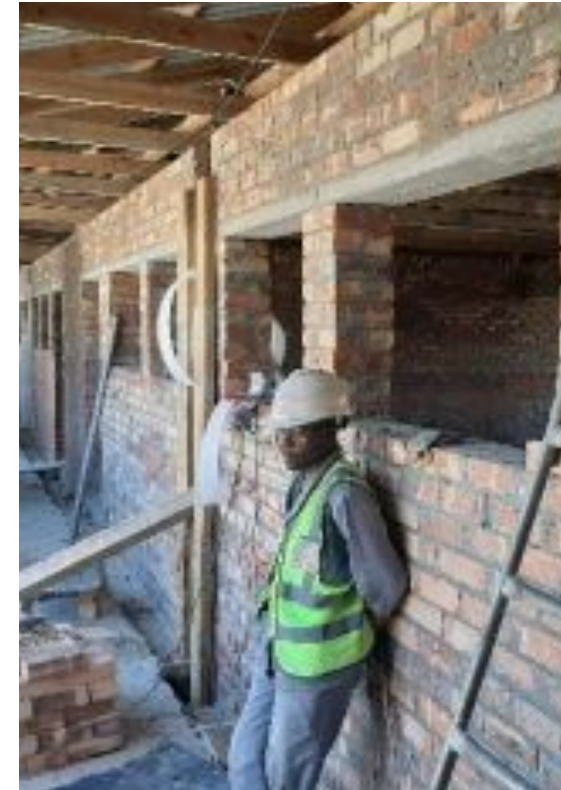
Bel Porto Learners with Special Education Needs