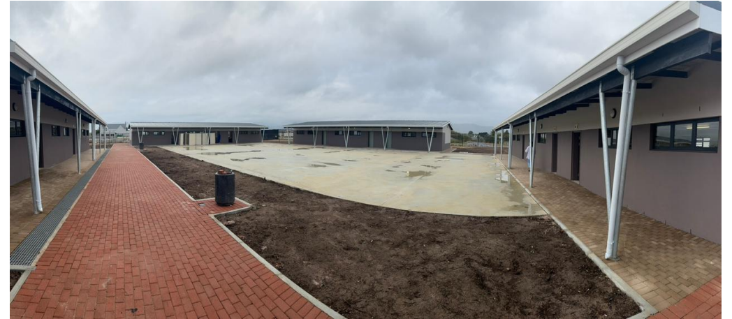
Fisherhaven Junior High School