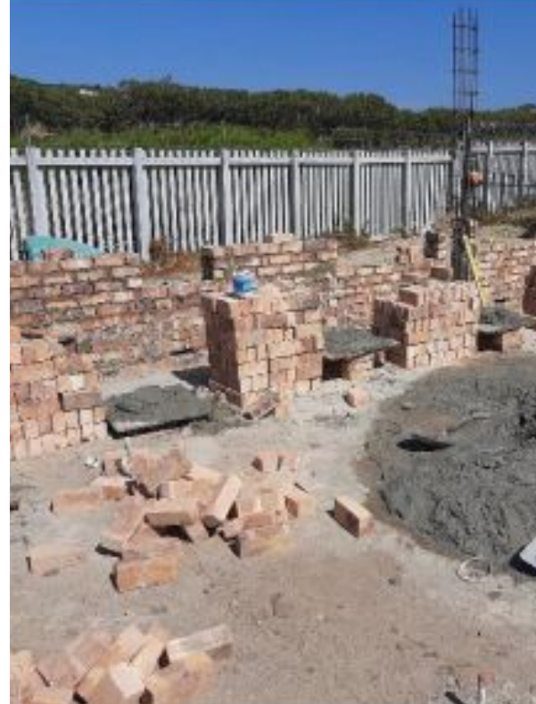
Beacon Learners with Special Education Needs