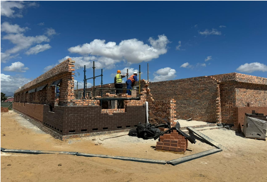
Blue Ridge Primary School