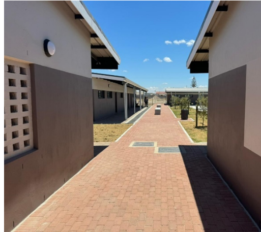
Perseverance Junior High School