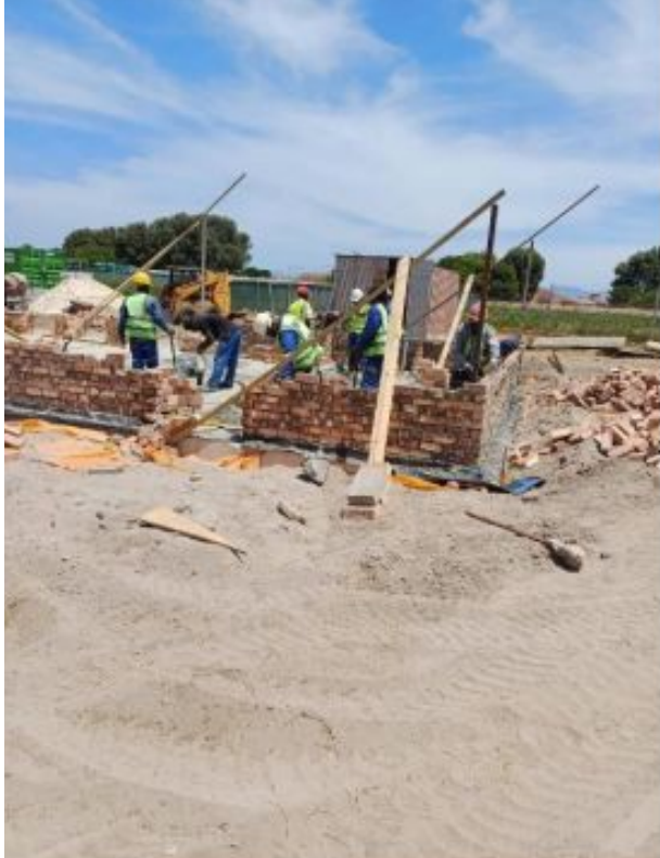
Lentegeur Learners with Special Education Needs