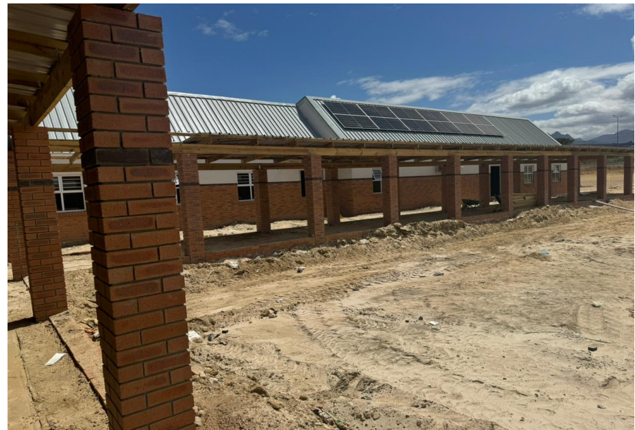
Lwandle Primary School