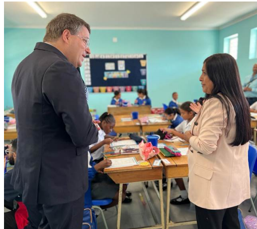
Westcott Primary School