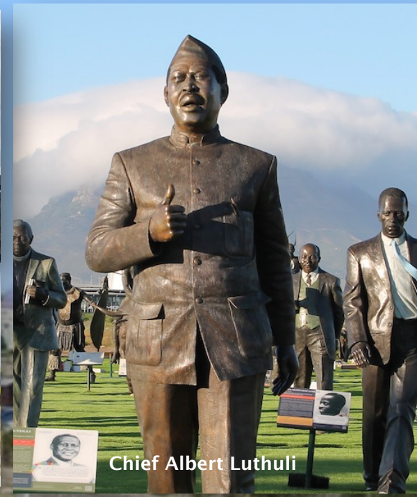
Chief Albert Luthuli