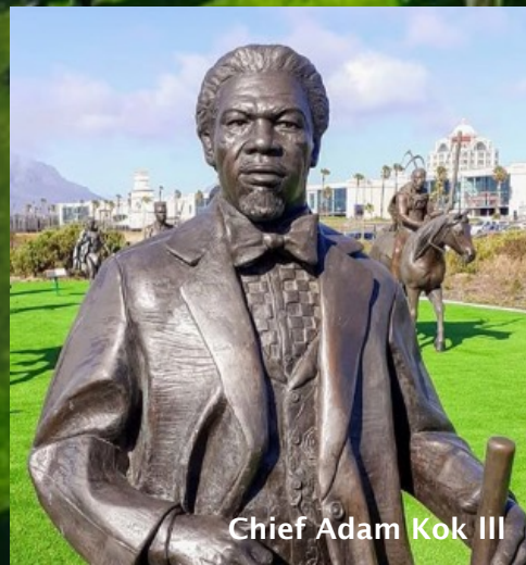
Chief Adam Kok III

AGAINST THE MAJESTIC BACKDROP OF TABLE MOUNTAIN, 100 FIGURES MOVE FORWARD IN CELEBRATION OF THE COUNTRY'S UNIQUE HERITAGE AND HISTORY