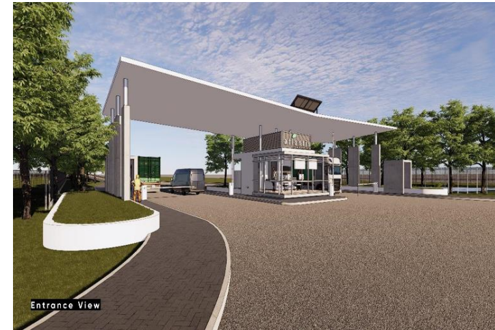
Zone 1 Entrance and guard gate