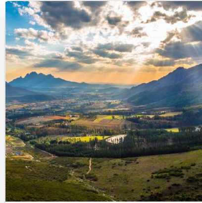
ANNUAL PERFORMANCE PLAN FOR 2021/22 DEPARTMENT OF ECONOMIC DEVELOPMENT AND TOURISM