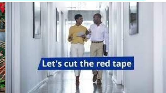
Let's cut the red tape