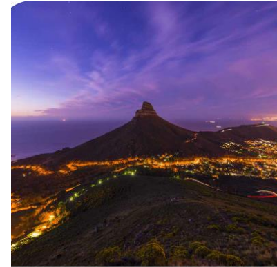
Annual Performance Plan 2022/23 Department of Economic Development and Tourism