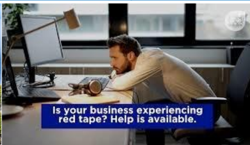
Is your business experiencing red tape? Help is available.