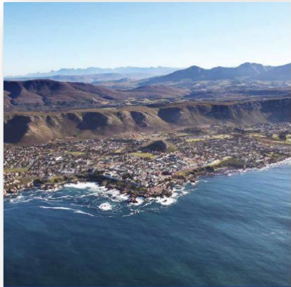
Annual Performance Plan 2020/21 Economic Development and Tourism