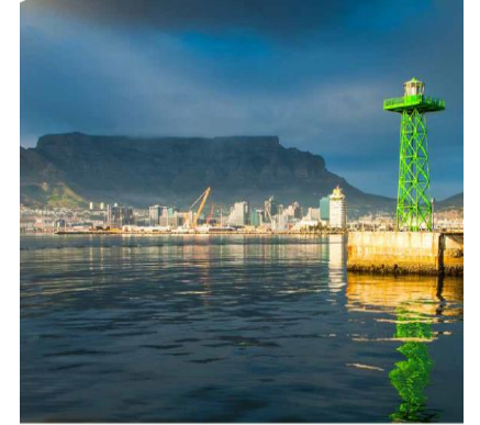
Department of Economic Development and Tourism Annual Performance Plan 2023/24