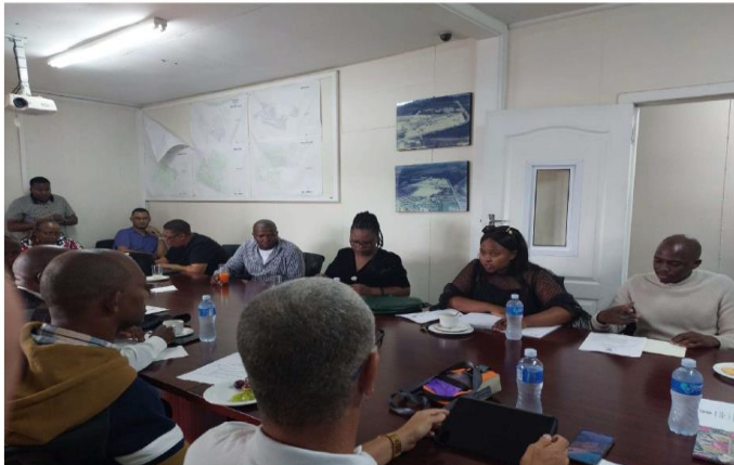
MINISTERIAL VISIT: 06 - 07 FEBRUARY 2023