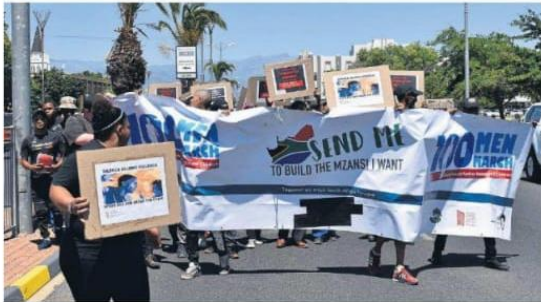
On 25 November the Breederivier Municipality launched an event in Worcester marking the start of 16 Days of Activism for No Violence against Women and Children, when a march was also held to foster gender-based violence awareness.

The event was concluded with an awareness march through High Street, Worcester.