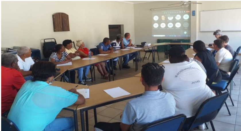
Example of Training Neighbourhood Watch groups in Overberg via MS Teams