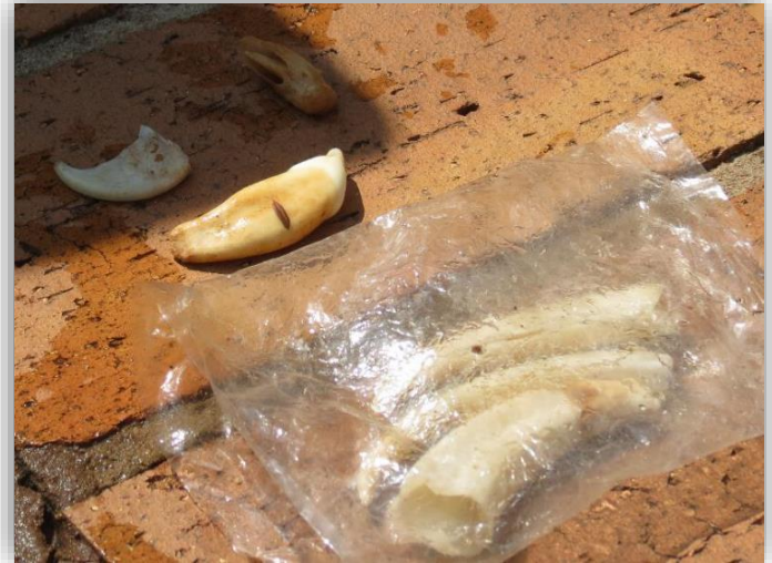
Lion claws and teeth