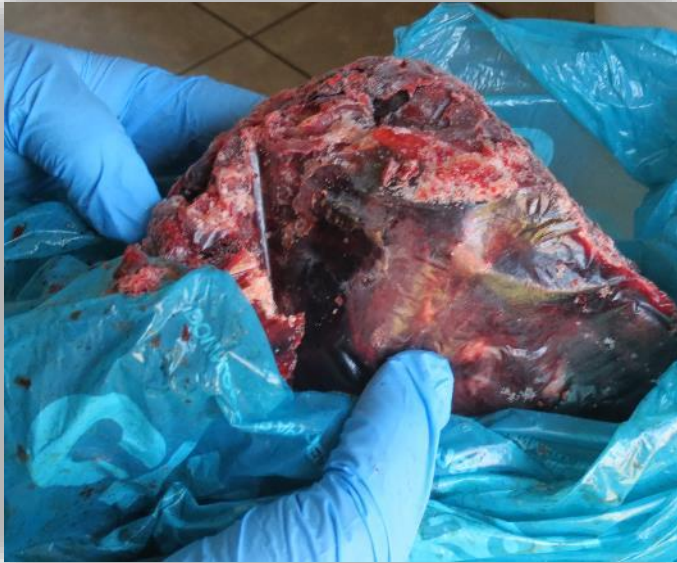
Unpermitted lion meat