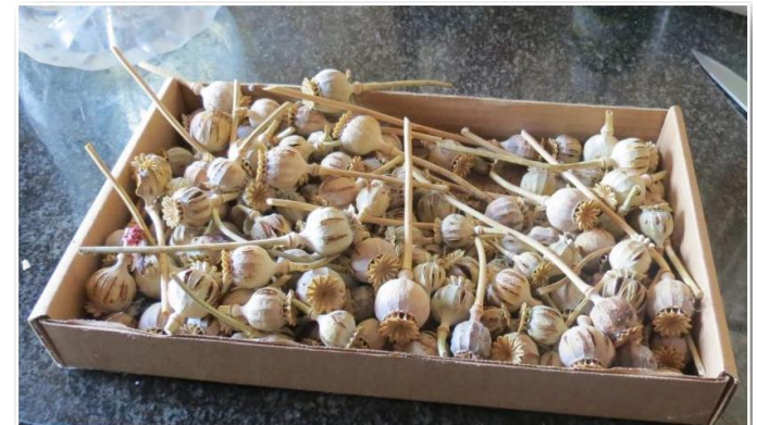
Opium factory bust – Joint ops