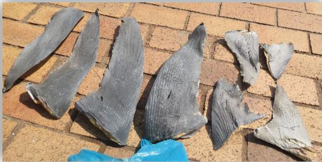
Illegally kept shark fins