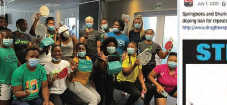
National Womens Rugby Squad Workshop