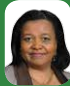
MS B.E.E MOLEWA