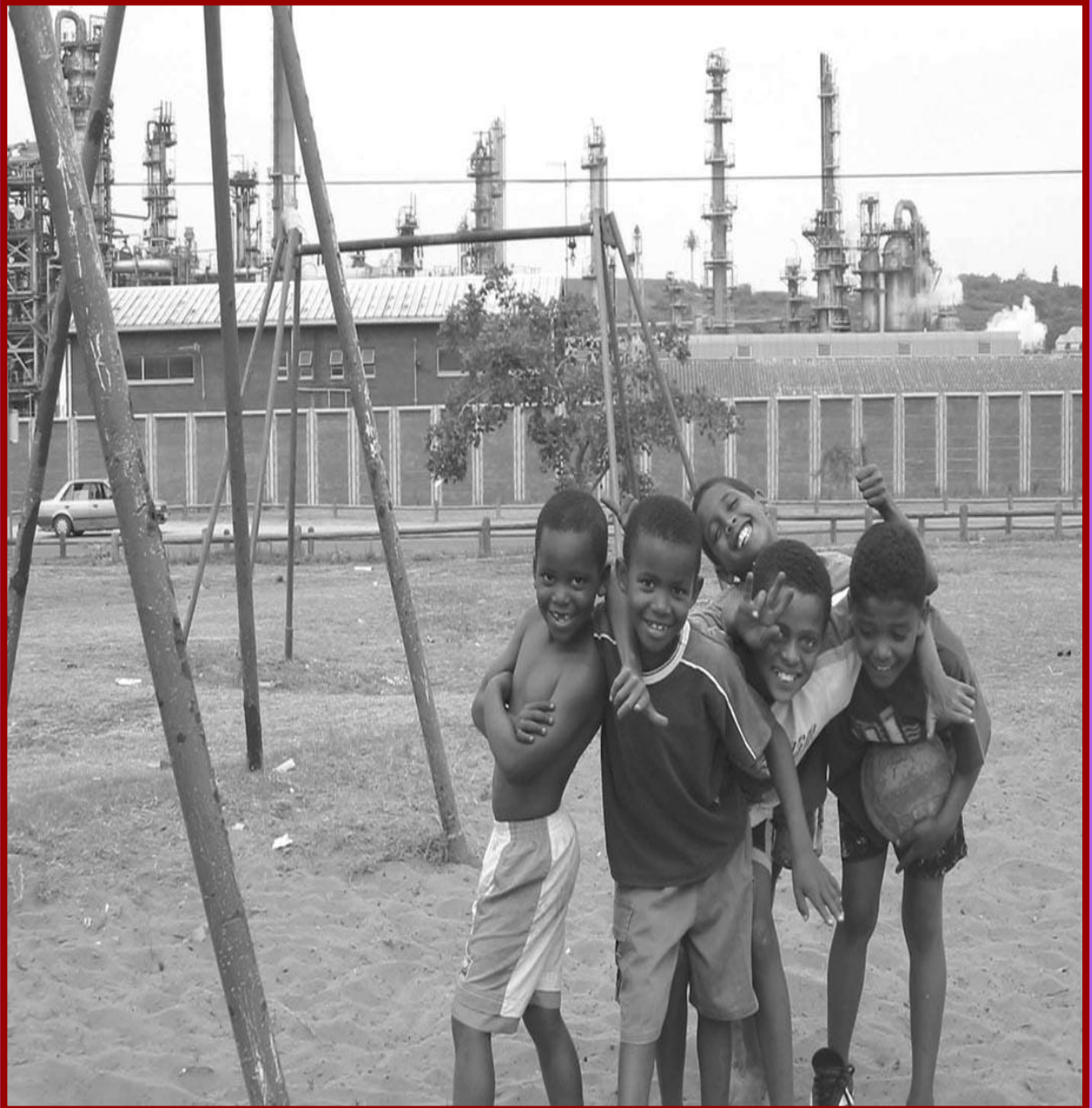
Children of Wentworth playing in a park next to Engen Refinery