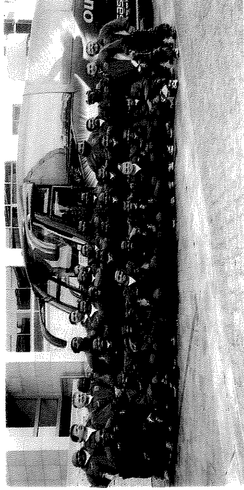
Gazelle Squad leaving for Calitzdorp on the Springbok bus. No tour took place last year due to lack of funding.