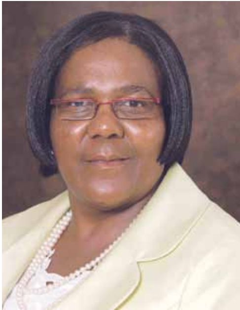
Ms Dipuo Peters, MP Minister of Transport

Once more we have pleasure in presenting the Annual Report of the financial year 2012/2013 where we highlight the Department's achievements, plans, and challenges, and how we plan to deal with those challenges.