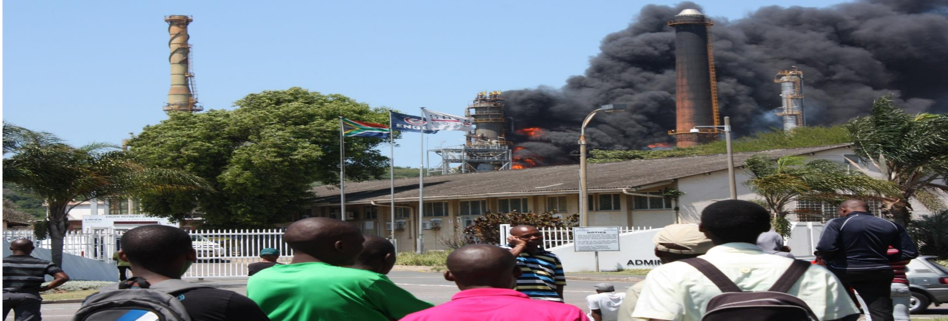
Fire at Engen Refinery: October 2011