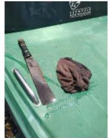
Makeshift boat & panga found on site