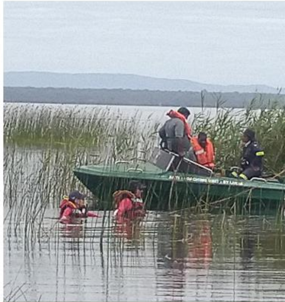
Search team, waist deep, combing the lake in sea